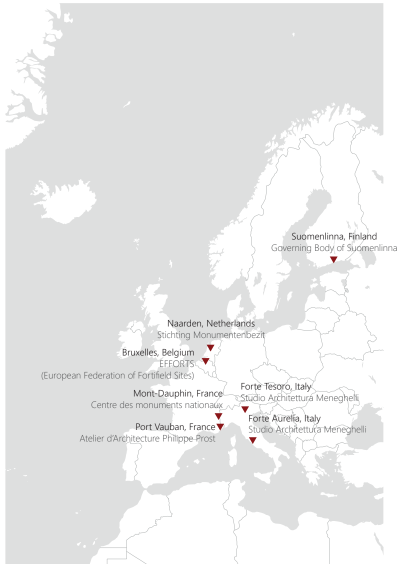
Resilient Fortress, Erasmus+ project partners organizations and case studies.

Erasmus + project named Resilient Fortress is designed for upskilling professionals facing the challenges of climate change and the increasing need of environmental responsibility in the context of fortified heritage.