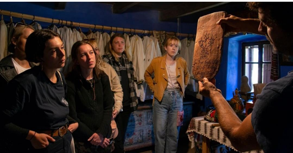
The European Heritage Training Course 'Conservation Works at a Fortified Church Ensemble' Hosman/ Romania 2021