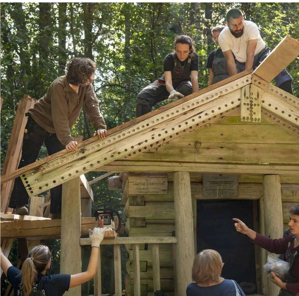
The European Heritage Volunteers Project 'Conservation of Traditional Wooden Architecture' Kenozero National Park / Russia 2021