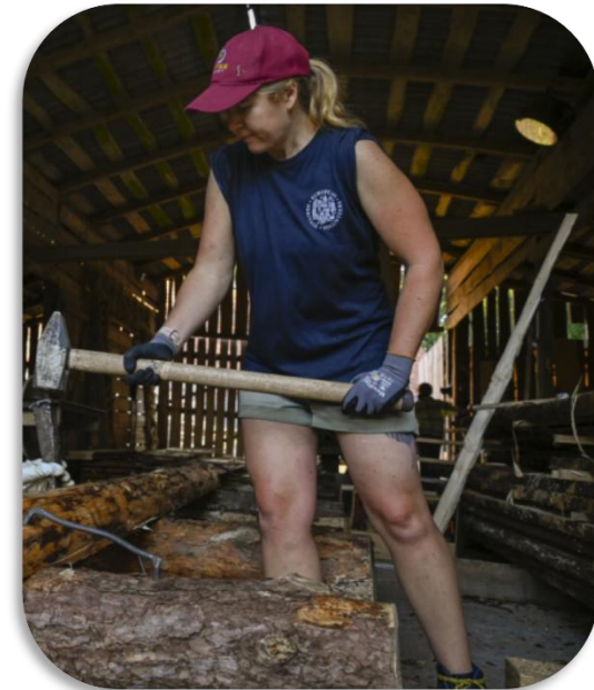
Alida, South Africa

"Over the past few years I have had the opportunities to live in 6 different cities in 5 different countries. There are many ways to connect to a community, but I have consistently found that engaging in community volunteering projects to be the best way to make that connection. It is especially good when I meet like-minded people who are as passionate as I am about the same topics. Whether it was volunteering at a soup kitchen, a tree planting organisation, a language café, or an Open Air museum (like in Lithuania), the hours that I spent volunteering are always part of happy memories".