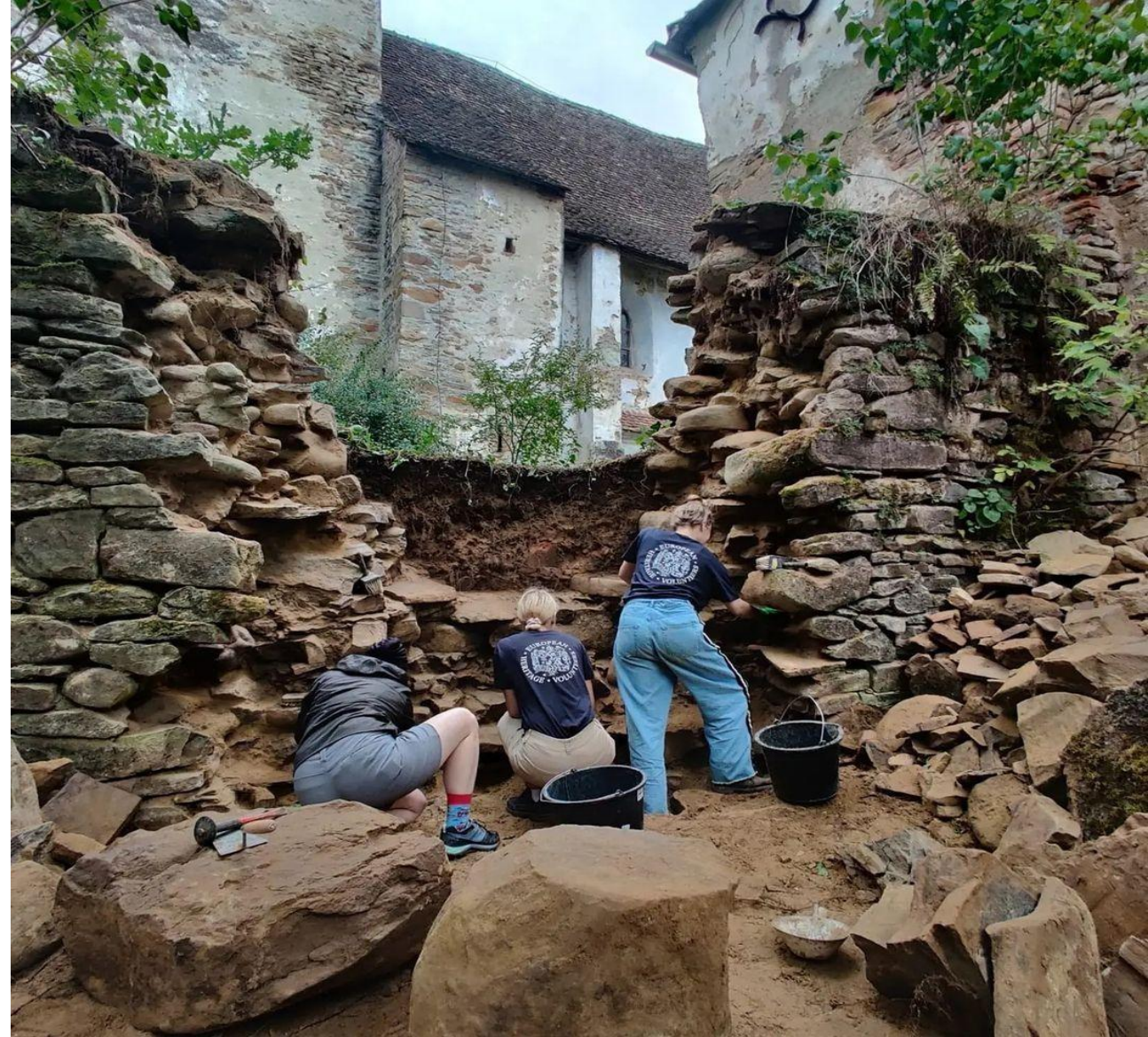
The European Heritage Volunteers Project 'Conservation of a Medieval Wall and a Tower' Movile / Romania 2021