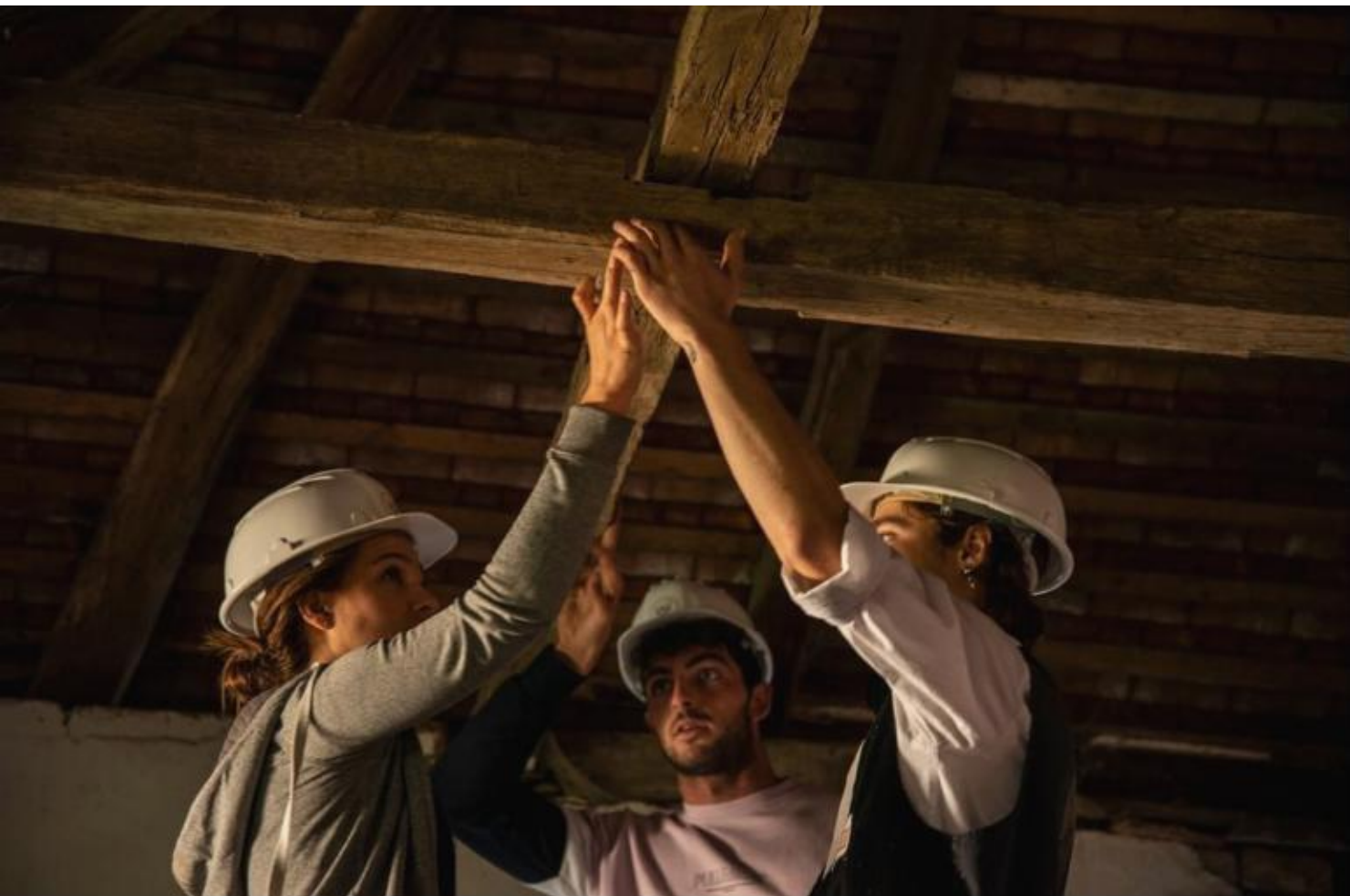
The European Heritage Volunteers Project 'Conservation Works at a Fortified Church Ensemble' Hosman / Romania 2021