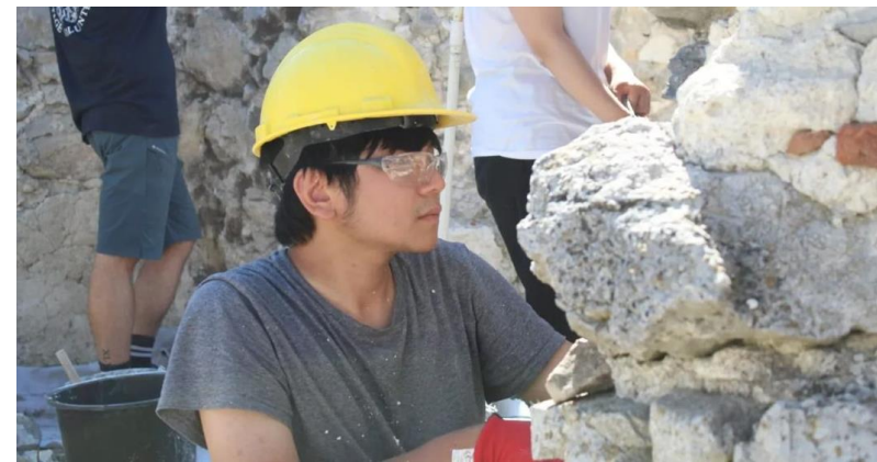
The European Heritage Training Course 'Traditional Masonry Techniques & Traditional Vaults' Tematín Castle /Slovakia 2022