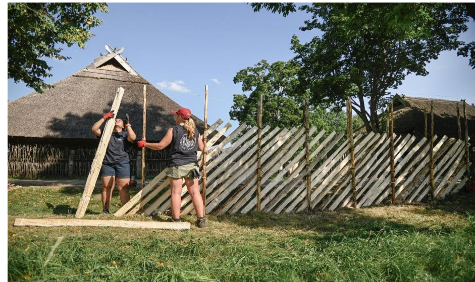
The European Heritage Volunteers Project 'Conservation Works at a Forge & Traditional Wooden Fences' Open-Air Museum of Lithuania 2022