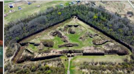
Fort no. 4