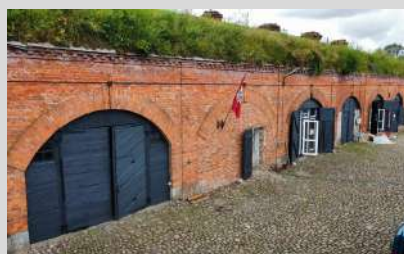
Kaunas Fortress Park workshop building