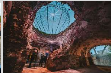
Fort no. 1