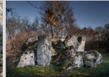
Fort no. 3