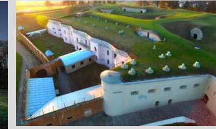
Fort no. 9