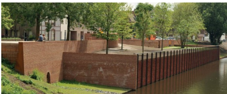
Maria stronghold in 's-Hertogenbosch