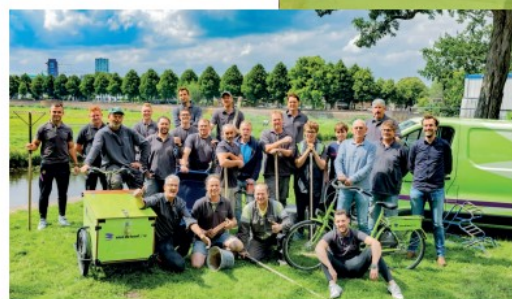
Restoration experts of fortresses and fortifications

" We believe in vital heritage sites, being actively used and being prepared for the climate to come. For the future of our past. "