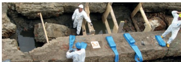
Transplantation of the 16th century fortress wall

The restoration of fortresses and fortified elements is an excellent opportunity to use these monuments as accelerators on many different levels. As a characteristic landmarks in urban developments, and as drivers for climate adaptation, energy transition, and biodiversity.