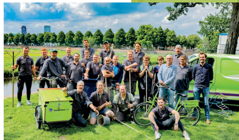
Restoration experts of fortresses and fortifications

" We believe in vital heritage sites, being actively used and being prepared for the climate to come. For the future of our past. "