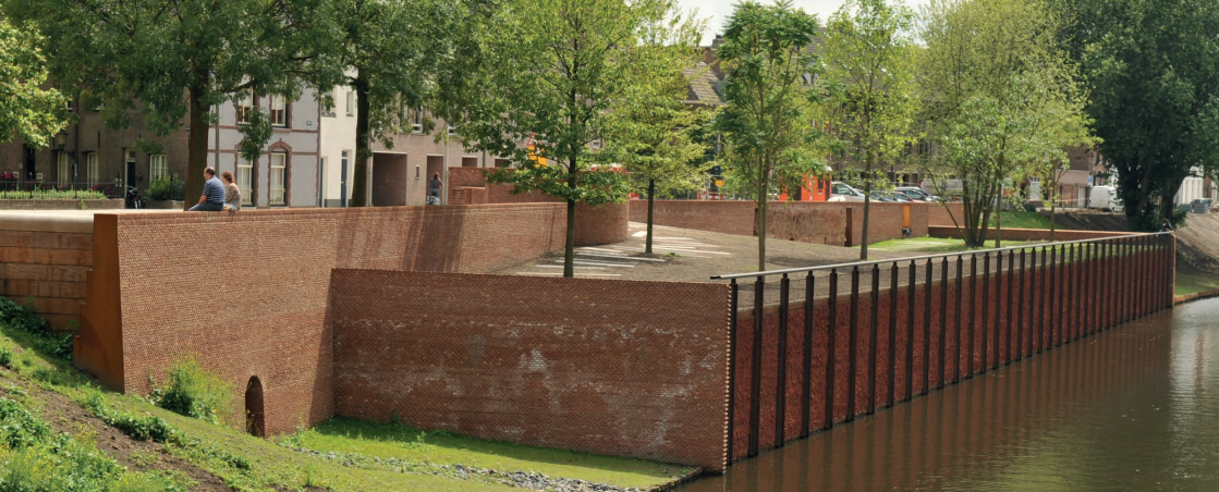
Maria stronghold in 's-Hertogenbosch