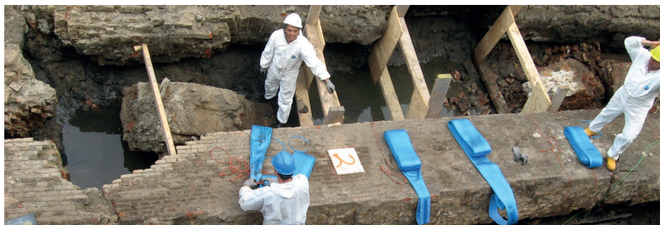
Transplantation of the 16 th century fortress wall

The restoration of fortresses and fortified elements is an excellent opportunity to use these monuments as accelerators on many different levels. As a characteristic landmarks in urban developments, and as drivers for climate adaptation, energy transition, and biodiversity.