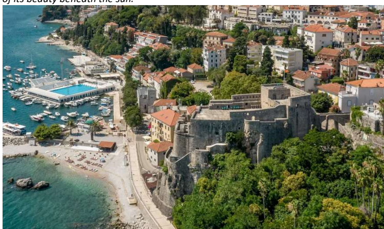
Forte Mare

The legend says there is a secret gate of the town of Herceg Novi. Gate at the sea coast opens only to friends of the town. Who isn't welcome there, won't be able to pass through it. The enemy, according to the legend, has never been able to open it. Now, the sea waves break over this gate. It keeps a story of the town and its beauty, gates, people, beautiful girls who were taken away by ships to faraway lands. It's a long and endless story and every citizen of Herceg Novi can tell you something about it, their version of the town's beginnings, of its beauty beneath the sun."