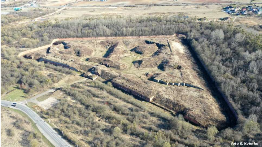
2022 : KAUNAS with KAUNAS EUROPEAN CAPITAL OF CULTURE 2022 (LT) : fortifications and communities