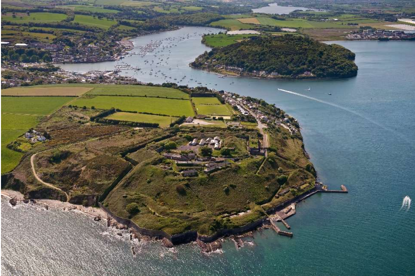
2021 : CORK COUNTY (IE) : Fortifications and the environment