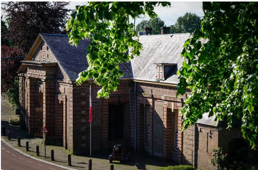
2024 GRAVE (NL) : (to be decided)