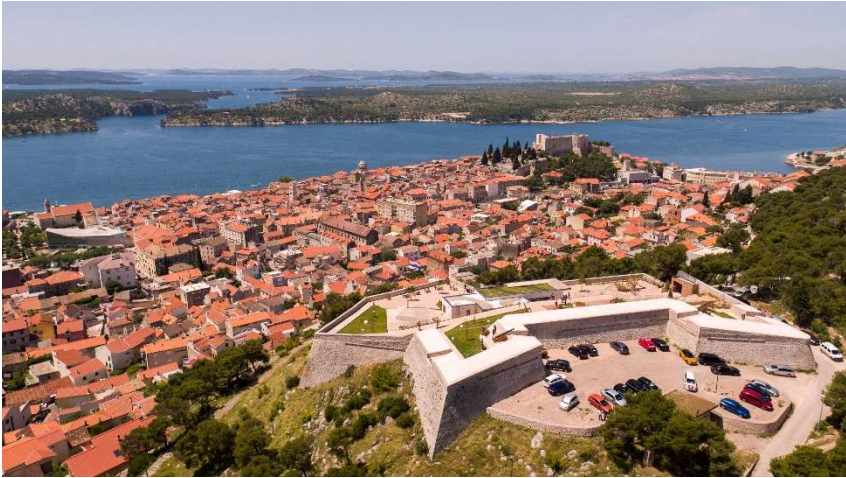
2020: SIBENIK (HR) : External funding of fortification heritage (18/11 AGM, 19+20/11 Congress)