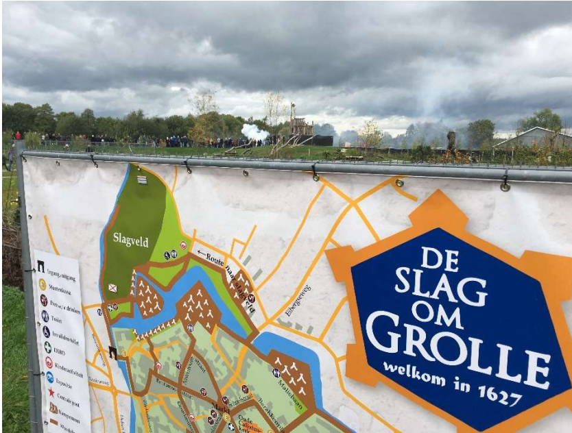
2023 : OOST GELRE (Groenlo, NL) : Fortification heritage, tourism and cultural routes