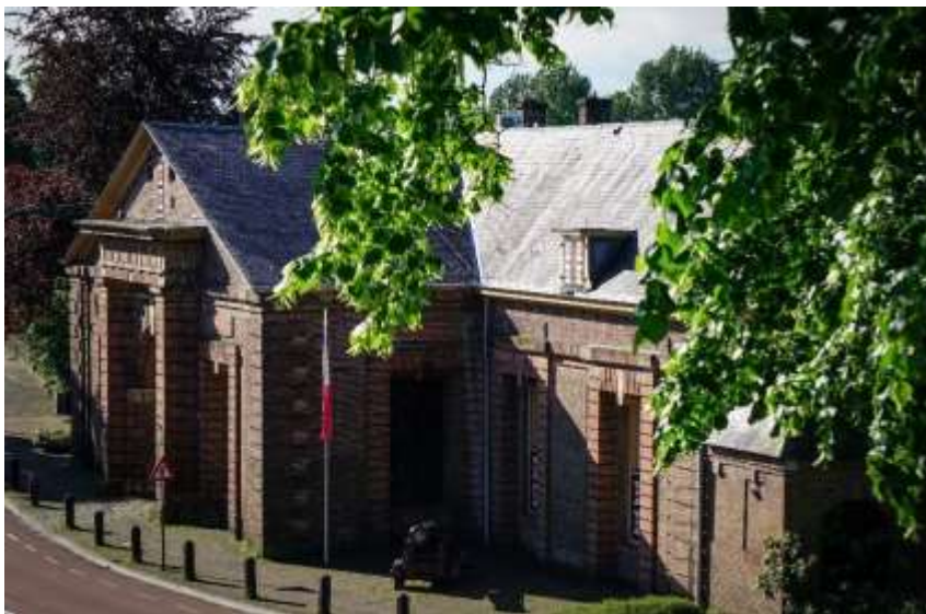
2024 GRAVE (NL) : (to be decided)