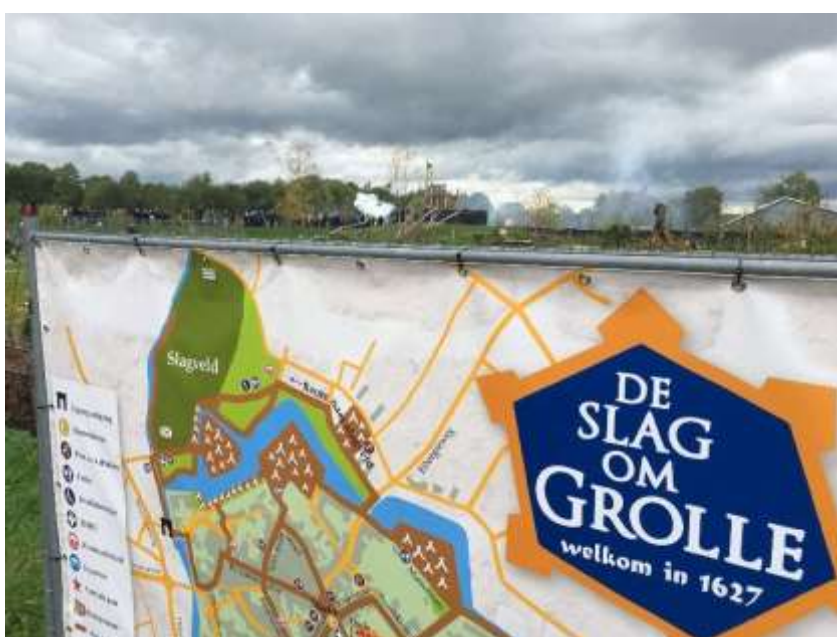
2023 : OOST GELRE (Groenlo, NL) : Fortification heritage, tourism and cultural routes