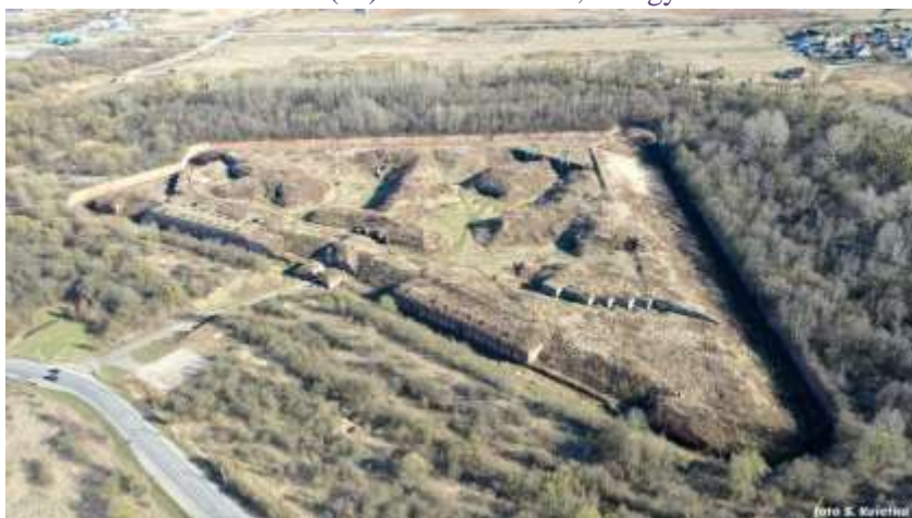
2022 : KAUNAS with KAUNAS EUROPEAN CAPITAL OF CULTURE 2022 (LT) : fortifications and communities