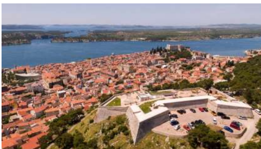
2020: ŠIBENIK (HR) : External funding of fortification heritage (18/11 AGM, 19+20/11 Congress)

- NEXT EFFORTS ANNUAL GENERAL MEETINGS AND CONGRESSES, with congress subjects