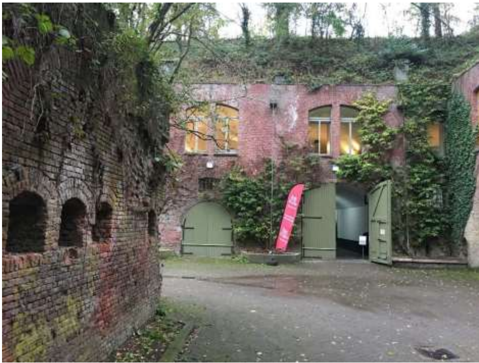
Fort 5, Edegem (Antwerp Fortress Belt system), also seat of EFFORTS member Simon Stevin Stichting VVC and a known co-working space (BLWRK).

The EFFORTS AWARD is being presented to the best / most innovative participant of European Fortress Day. This was the Antwerp Fortress Belts system ('Fortengordels'), who with a lot of volunteers succeeded in more than doubling its participation. EFFORTS also supports its Fortenevent (part of European Fortress Day) and its fortengordels.be website management.