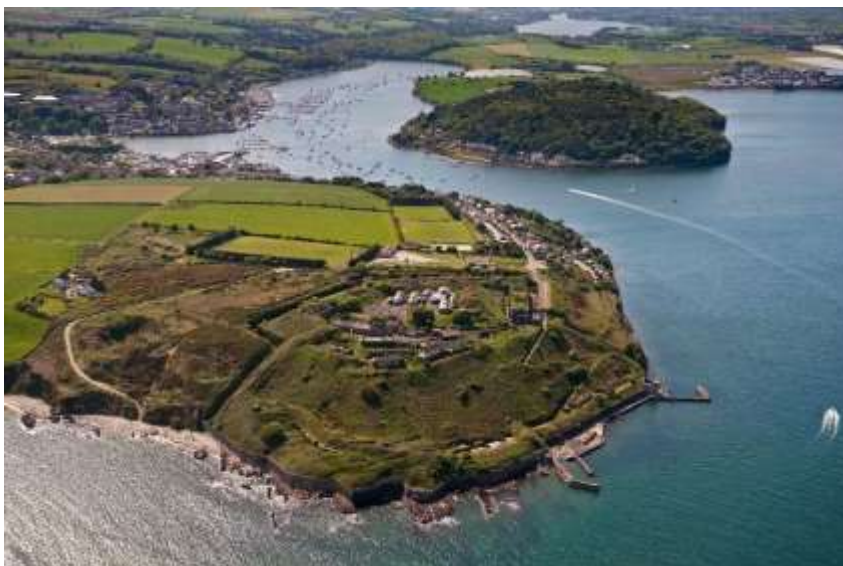
2021 : CORK COUNTY (IE) : Fortifications, energy and climate measures