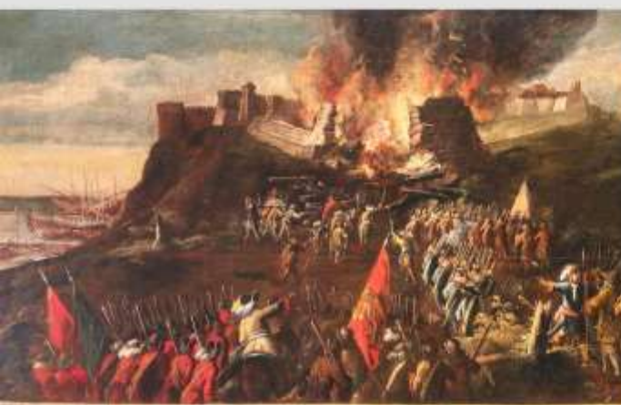
FRAN MOROS K PROC ECAP GIVALE DOPO QVARANTA NOVEG FATTEFINALAT VOLARE DVE MINE, L VIVA DICENTO, L'ALTRADII DI POLIVERE ESPAGNA LA PIAZZA DI CORON IN MORIA A FORZADIA MILLE ESEI CENTO VI PIENDE, CENTO LE CINOVE CANNONI, ARRIBA A EFRA IL CANDOS OGGIOGATO DIFFORI, EQVELLI DI DENTRO MITGULA A TORONI.