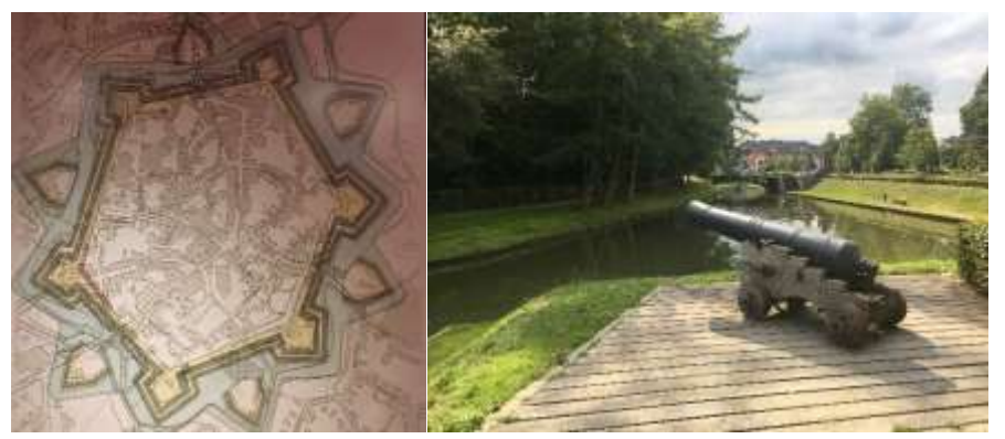
Two impressions of the original and present state of the Grol fortifications.