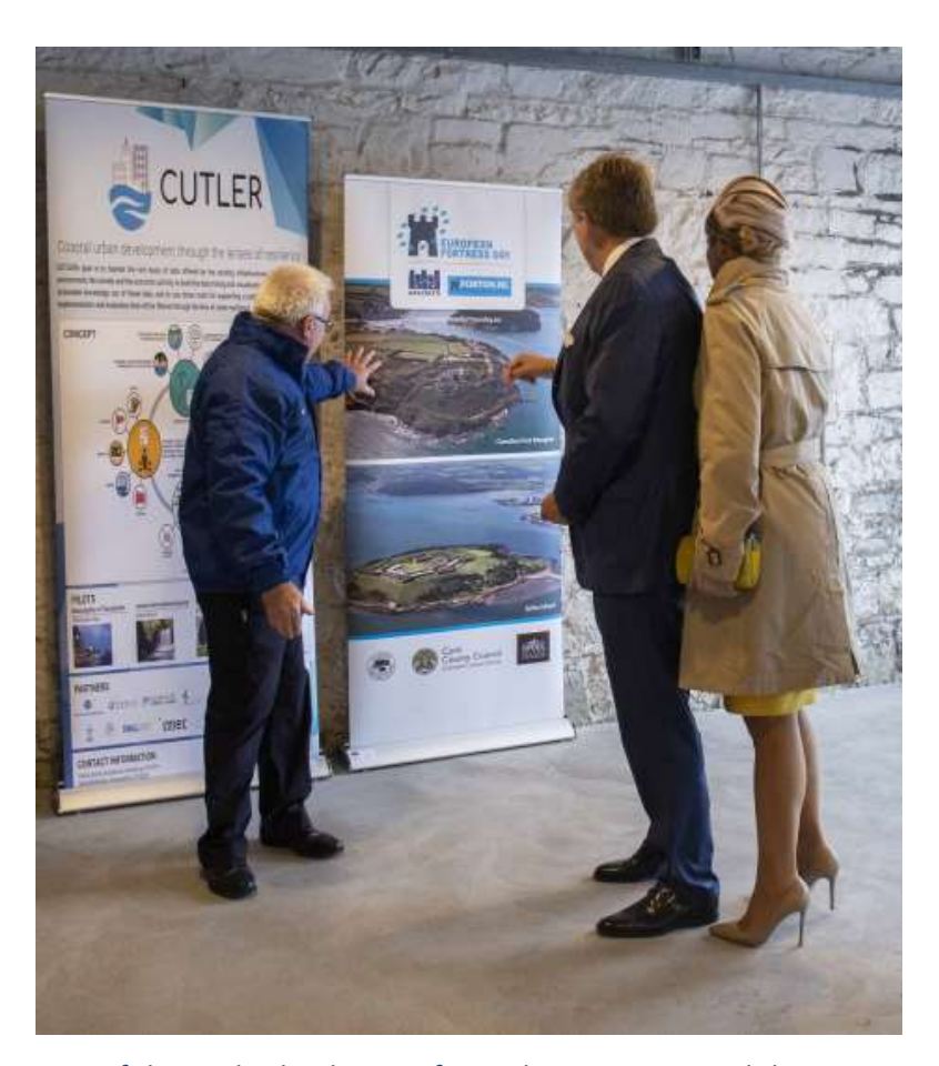
The King and Queen of the Netherlands are informed on EFFORTS and the European Fortress Day

From there, it was on to Crosshaven, and Camden Fort Meagher, where the Royal couple were met by Tánaiste Simon Coveney, and some local volunteer groups, including the Rescue Camden Volunteers, who King Willem-Alexander and Queen Máxima praised for their substantial contribution to the restoration of the Fort.