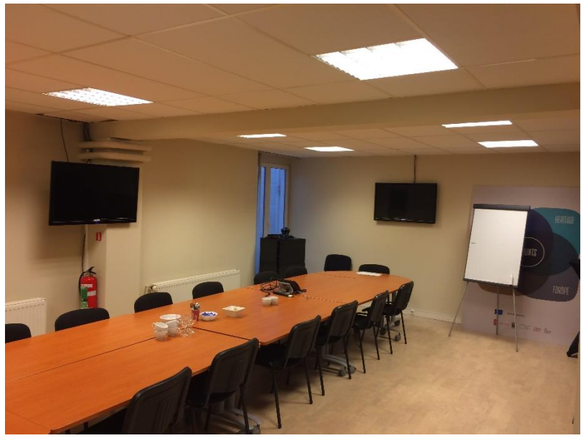
BOARD MEETING - 22 MARCH 2018